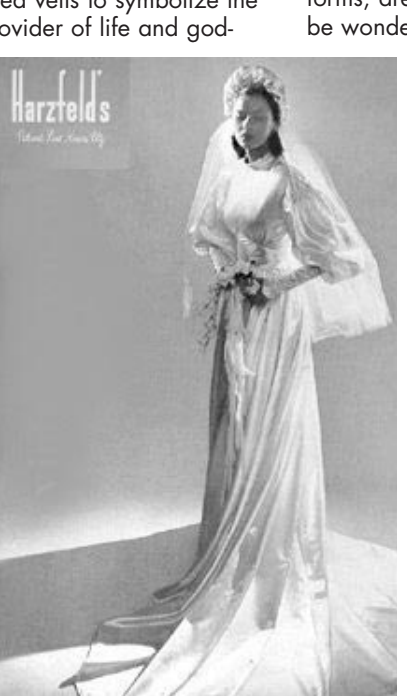
Old Harzfeld's ad

dess of the home. Speculation is that pre-historic civilizations veiled the bride's face to ward off any evil spirits surrounding a bride as she approached her betrothal. Still others believe veils are a gesture to the ancient tradition of the carrying-off of a bride by the groom, during which he would throw a blanket over her to make